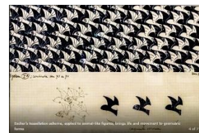
M.C. Escher: Scheme

https://arthive.com/escher/works/200368~Pegasus_No_105#show-work://200412