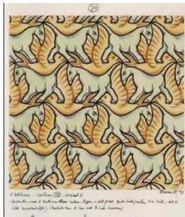
M.C. Escher: Hourse and bird

https://arthive.com/escher/works/200368~Pegasus_No_105#show-work://200394