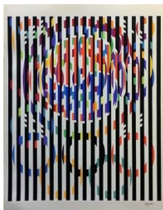
Yaacov Agam: Message of peace https://www.artsper.com/us/contemporary-works/print/111271/message-of-peace