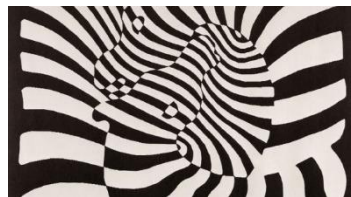
Victor Vasarely: zebras https://www.jpm.hu/hirek/2012-08-14-victor-vasarely-muzeum

Work individually! Make a similar drawing! The following example will help you.