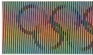
Carlos Cruz Diez: Untitled https://www.invaluable.com/auction-lot/carlos-cruz-diez-caracas-1923-2019-untitled-1992--103-c-00c4ec0874