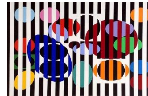
Yaacov Agam: Untitled https://www.renjeau.com/artwork/agam-yaacov/untitled-28x40-lithograph/