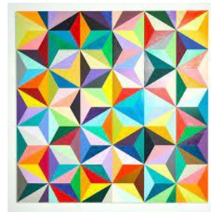
Yaacov Agam: Geometric abstract

https://centaurgalleries.com/custom_type/capella/