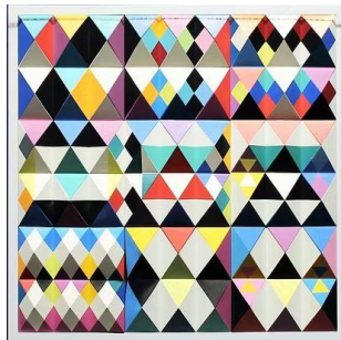
Yaacov Agam: Capella

https://www.pinterest.co.uk/pin/362399101242275146/